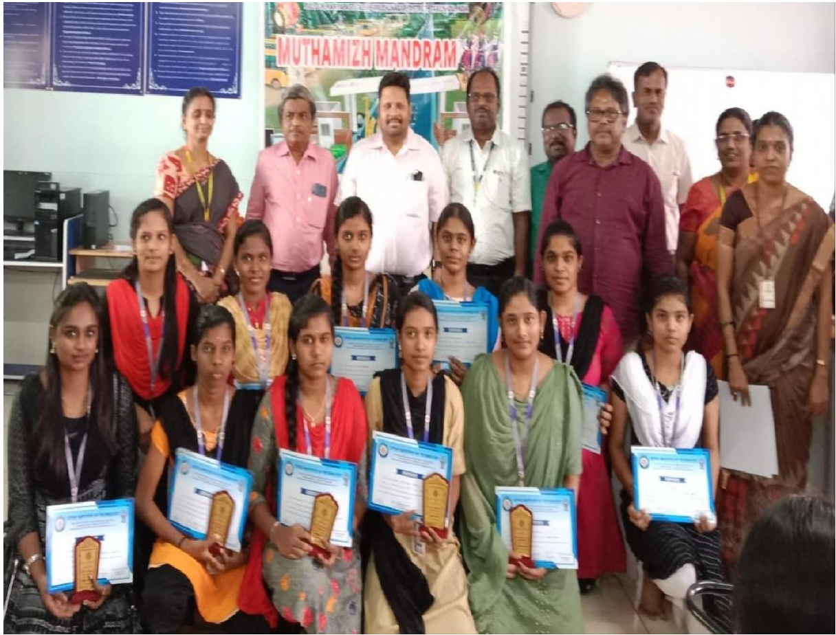
Prize distribution function of muthamizh mandram cultural competition