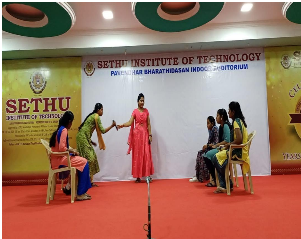
Group dance, Tamil Elocution, Quiz and various events conducted during mother language day on 21-02-2022.