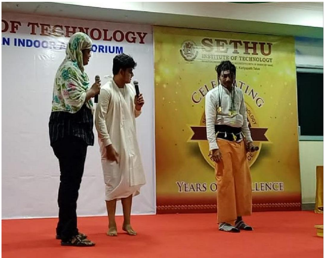
Tamil skit, best of waste and various events conducted during SVEEP contest (voter's day awareness) on 16-12-2021